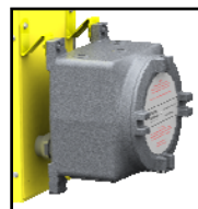
Electrical Enclosure "A" (120VAC) or "B" (24VAC)