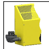
Left Side Electrical Enclosure Option Code "LC"