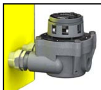
Electrical Enclosure "C" with optional built-in "T1" thermostat and using line voltage