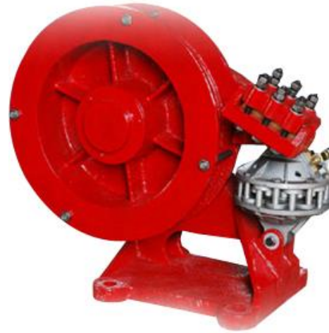
75,000 LB Single Line Pull

Full line of all-weather, quality-built deadline anchors pull capacities from 30,000 to 100,000 pounds. Constructed with top-quality steel and proof-tested to 120% of rated capacity, Deadline Anchors are highly accurate, super-strong anchors of exceptional reliability. Anchors are for use with 16" Weight Indicator Series and Load Sensors.